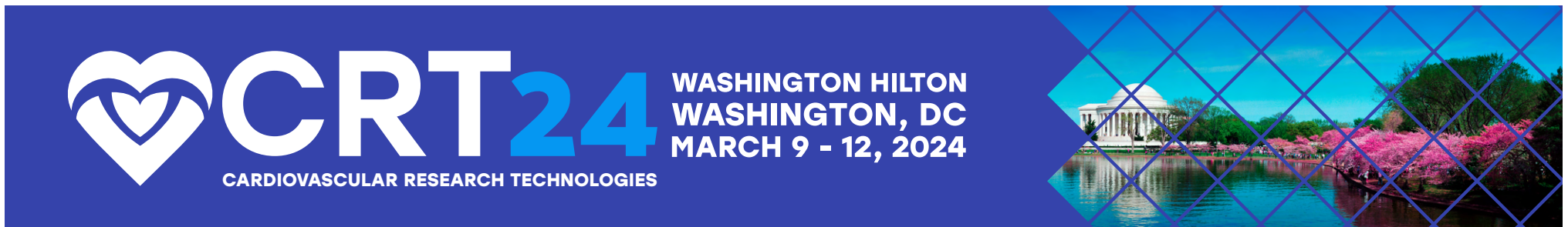
Photo Usage: Photo usage should be accompanied by a geometric grid to mask the image for the following effect.

The year should always be the alternate color of the main color