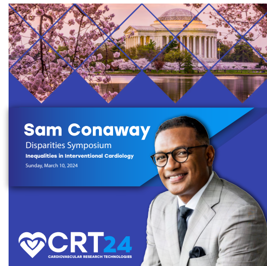
Keynotes/speakers should be accompanied by a trapezoid that will house their name and any relevant information.