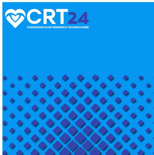
Pattern option as background for graphic and textual content.